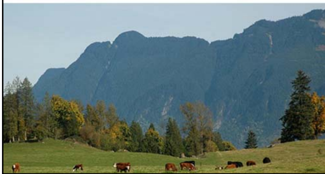
Agricultural Land Reserve Boundary Review